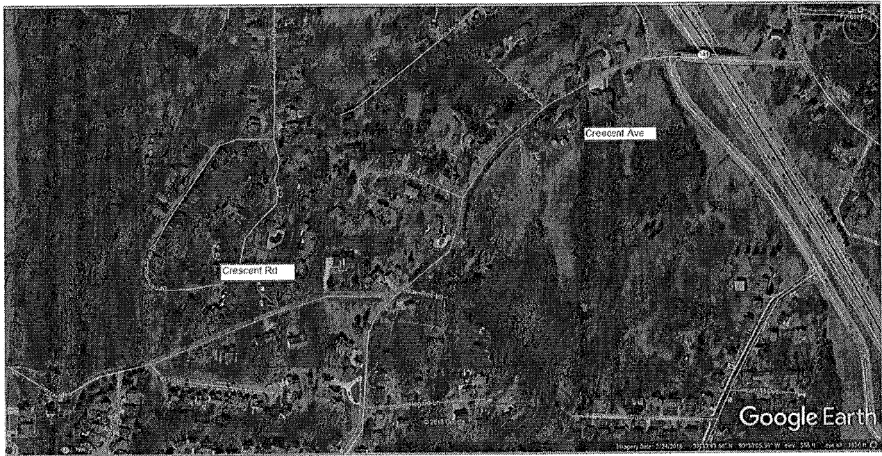
EXHIBIT E Project Area