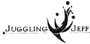
Exhibit A Proposal

Ignite & Engage with Laughter & Respect ~ EMPLOYMENT AGREEMENT ~ REV 01