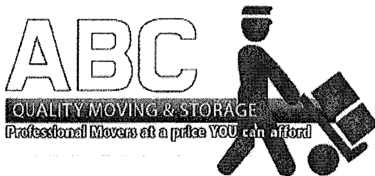
Exhibit A Proposal/Scope of Services

"Professional Movers at a Price YOU can afford"